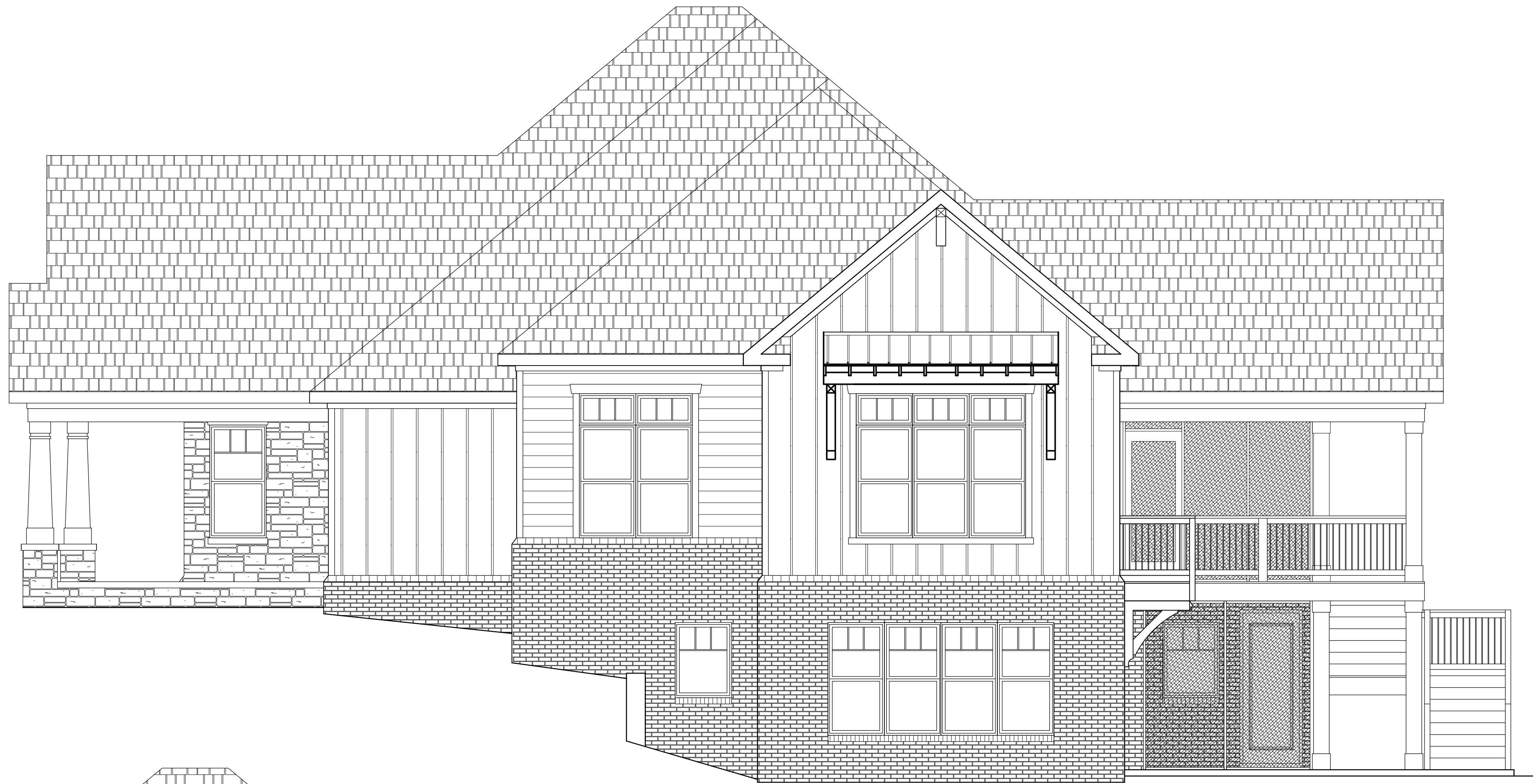
PROPOSED RIGHT SIDE ELEVATION